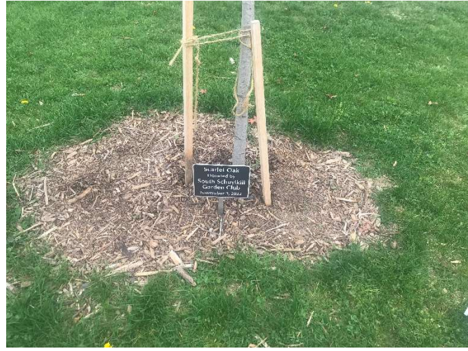
Sign recognition from the Green Goose