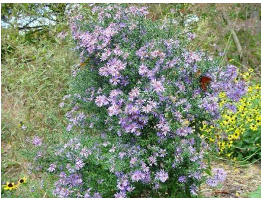
Smooth aster 'Bluebird'