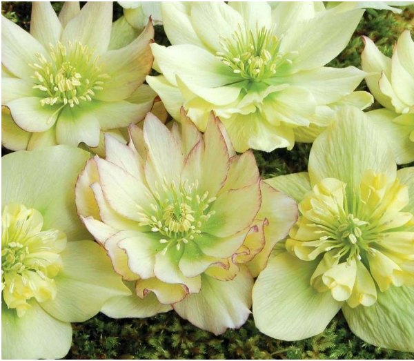
Lenten rose 'Golden Lotus' ( Helleborus x Winter Jewel ™ Series)