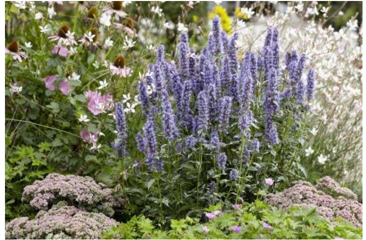
Hummingbird mint ( Agastache rugosa ) 'Crazy Fortune'

And don't forget to add grasses to your garden! Ornamental grasses add color, texture, and fall and winter interest to your landscape. They are deer resistant. Three favorites: