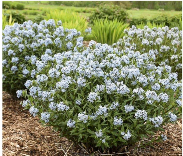
Blue star 'Starstruck'