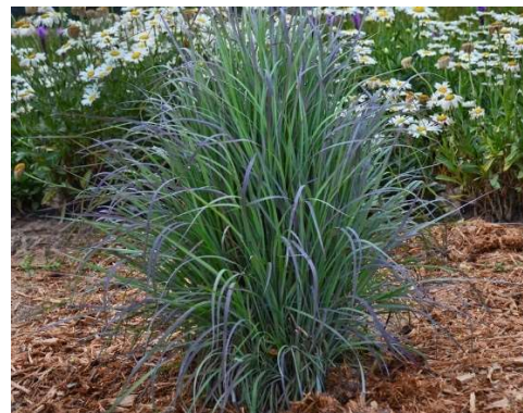
Little Bluestem 'Twilight Zone'