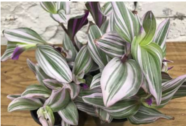
Tradescantia 'Bubblegum'.

Explore some new varieties of old favorite indoor plants, including the versatile peperomia, “mini monstera,” croton, Fatsia, ZZ plant, and members of the Ficus family.