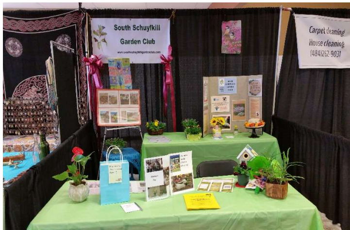
Display at Home and Garden Show